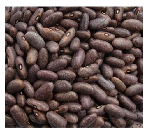
5. Mwezi moja

Figure 1. Bean varieties used in the study (Mwitemania, Rose coco, Nyayo, Canadian wonder, Mwezi moja)